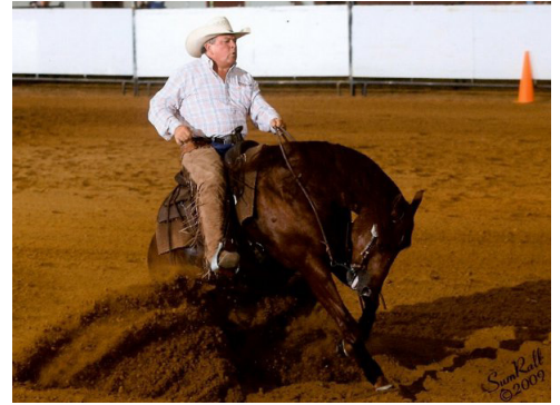
Facebook: Terry Thompson, Inc.

For information on the Tulsa Reining Classic, visit the web site at www.tulsareining.com or call (580) 759-2525